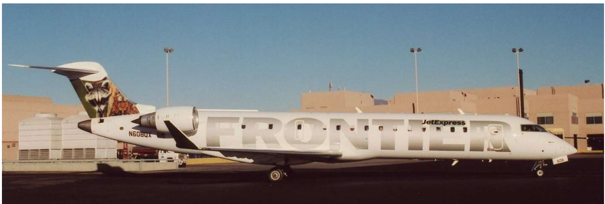
Frontier JetExpress Bombardier CRJ-700 featuring a raccoon motif at the Albuquerque Sunport.