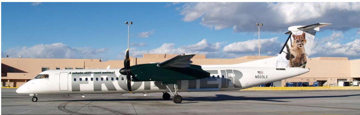
Frontier DeHavilland Dash-8-Q400 featuring a mountain lion motif at the Albuquerque Sunport.