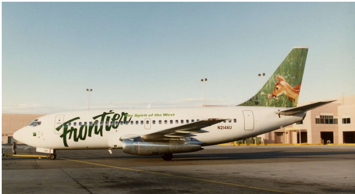
Frontier Boeing 737-200 featuring "Clover" the fawn at the Albuquerque Sunport.

A new Frontier Airlines evolved in 1994 which was molded much like the former Frontier using Boeing 737-200 jets and with its headquarters and hub city at Denver, Colorado. The aircraft however carry a new wildlife theme with decals of animals, birds, and reptiles on the tails of each plane. The first fleet of Boeing 737 aircraft carried different wildlife on each side of the tail. This Frontier began service to Albuquerque on October 13, 1994 with flights to Denver and El Paso. Newer and more modern 737-300 aircraft were added in 1995 and the carrier completely changed over to Airbus family jets beginning in 2001 operating the A318, A319, and A320 versions. The El Paso flights were discontinued in 2004.