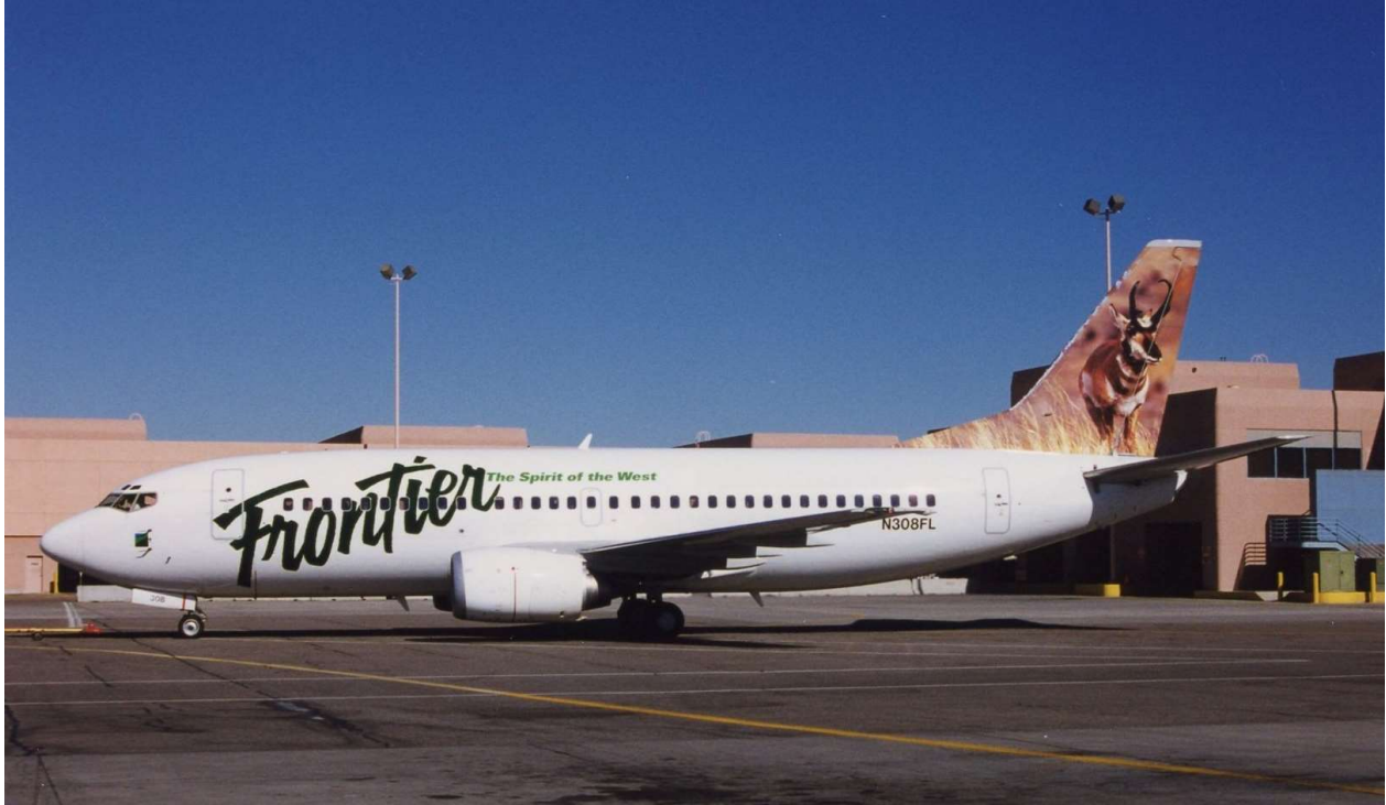
Frontier Boeing 737-300 featuring a pronghorn antelope at the Albuquerque Sunport.