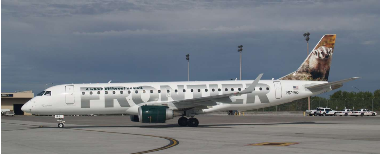
Frontier Embraer 190 featuring "Buddy" the badger at the Albuquerque Sunport.