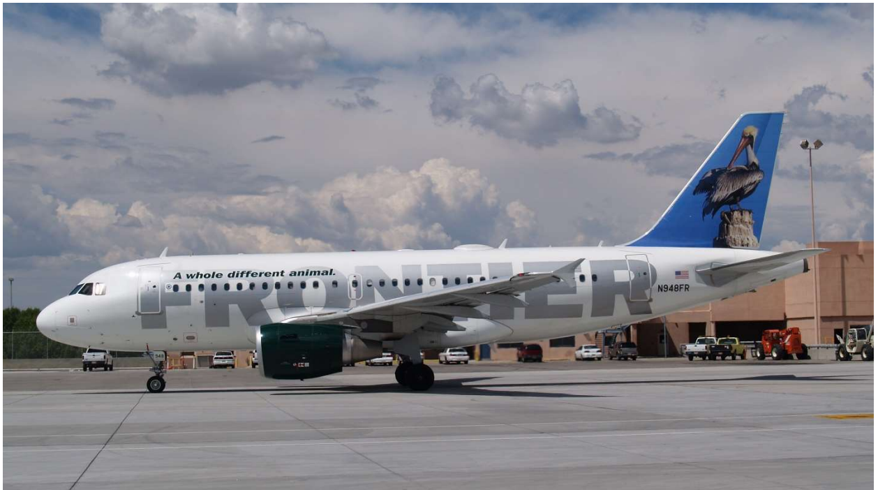
Frontier Airbus A319 featuring "Pete" the pelican and wearing a new billboard livery introduced in 2001 at the Albuquerque Sunport.