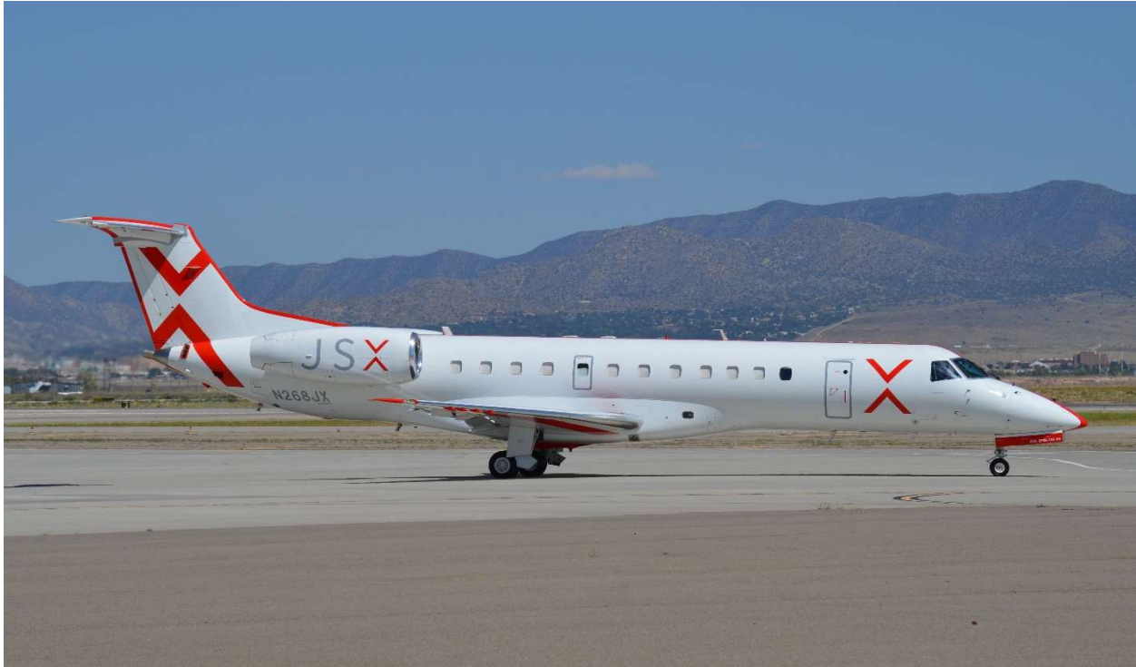
JSX Air Embraer-135 at the Albuquerque Sunport in 2020.