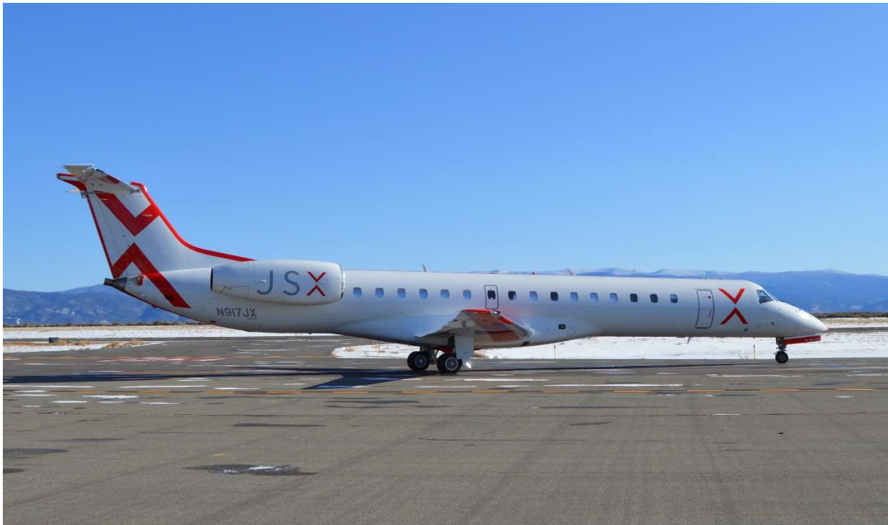
JSX Air Embraer-145 at the Taos Regional Airport upon inauguration of service in December, 2022.