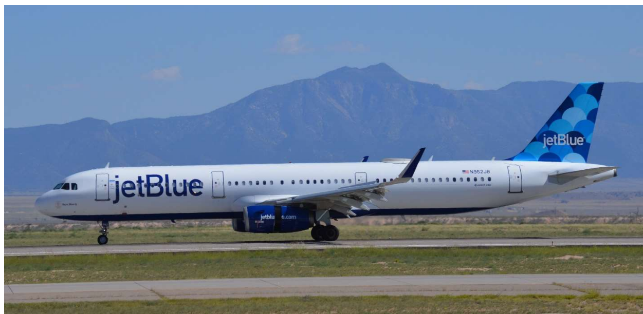
JetBlue Airbus A321 landing at the Albuquerque Sunport in 2022.