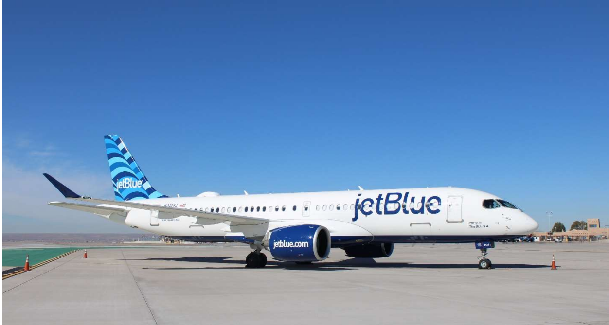
JetBlue began flying the Airbus A220-300 on its flight to Albuquerque beginning in early 2024.