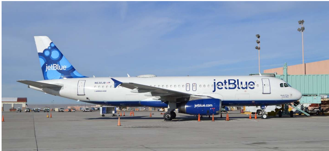
JetBlue Airbus A320 at the Albuquerque Sunport in 2016.

JetBlue has many different designs on the tails of its aircraft and each aircraft carry unique slogans such as “Mystic Blue” and “Blue Jean Baby.” The aircraft used on the inaugural flight to ABQ, N821JB, was nicknamed “Blue Yorker”.