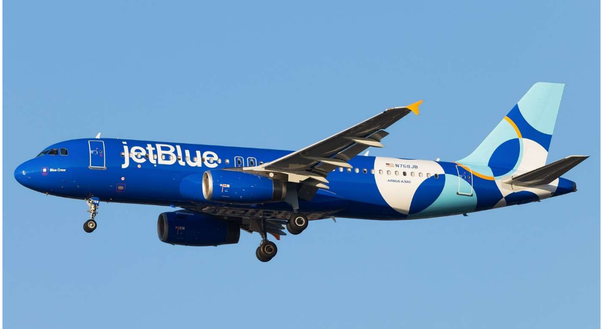
JetBlue introduced a new livery on its Airbus A320's beginning in late 2023.