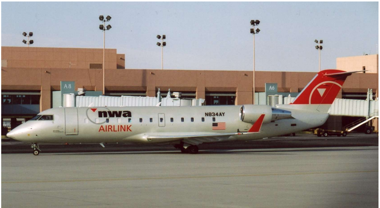
Northwest Airlink Canadair CRJ-200 operated by Pinnacle Airlines in 2005 at the Albuquerque Sunport.