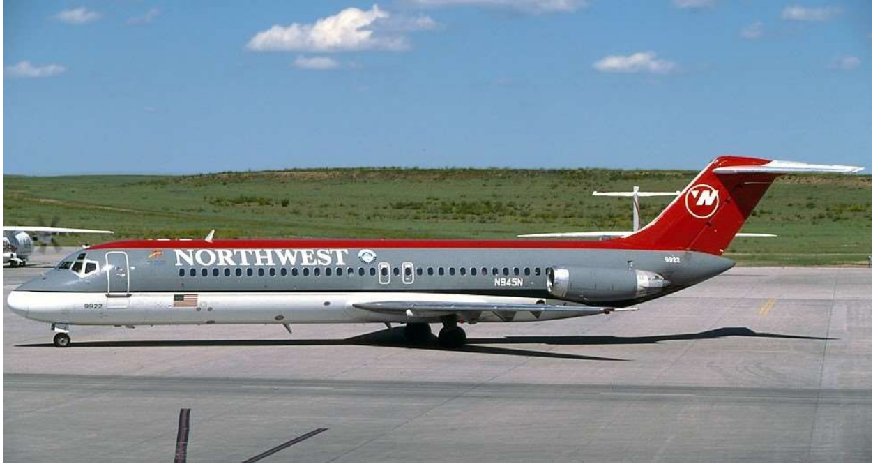
Northwest Douglas DC-9-30