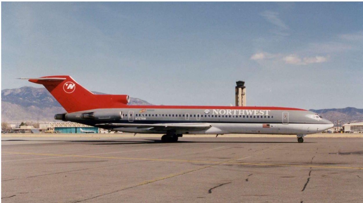
Northwest Boeing 727-200 at the Albuquerque Sunport