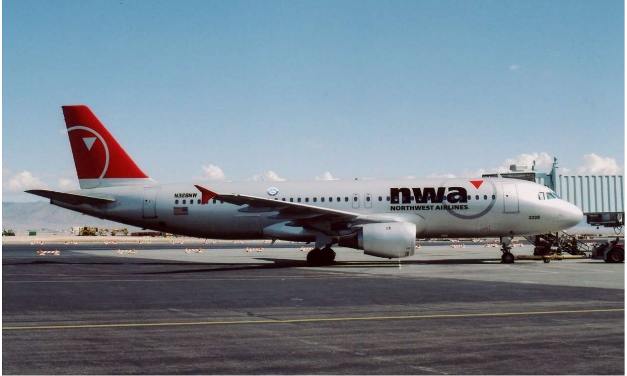
Northwest Airbus A320 at the Albuquerque Sunport wearing a new livery introduced in 2003